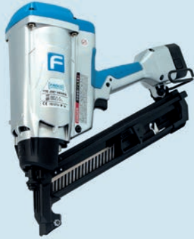
F70G JOIST HANGER Nailer