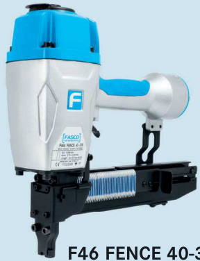
F46 FENCE 40-315