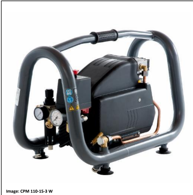
Image: CPM 110-15-3 W