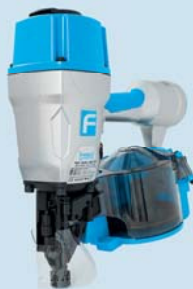
F60 CN15W-PS90 SCR